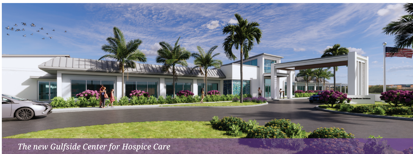
The new Gulfside Center for Hospice Care